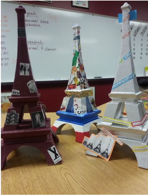
NZ School Curriculum taught in French & English